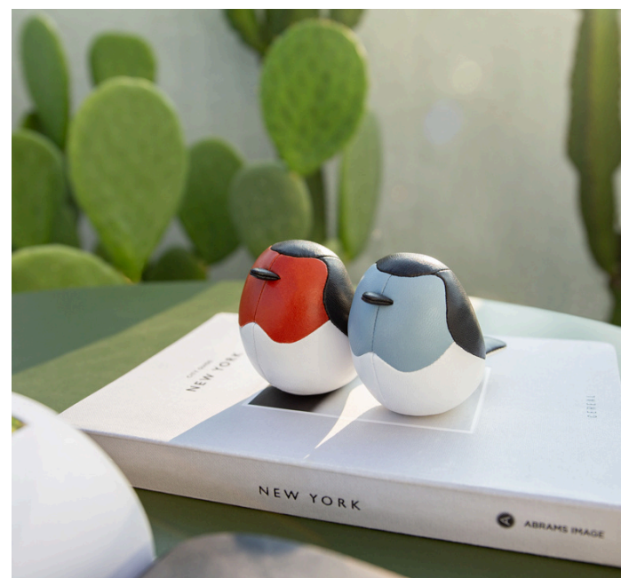
Exclusive color development