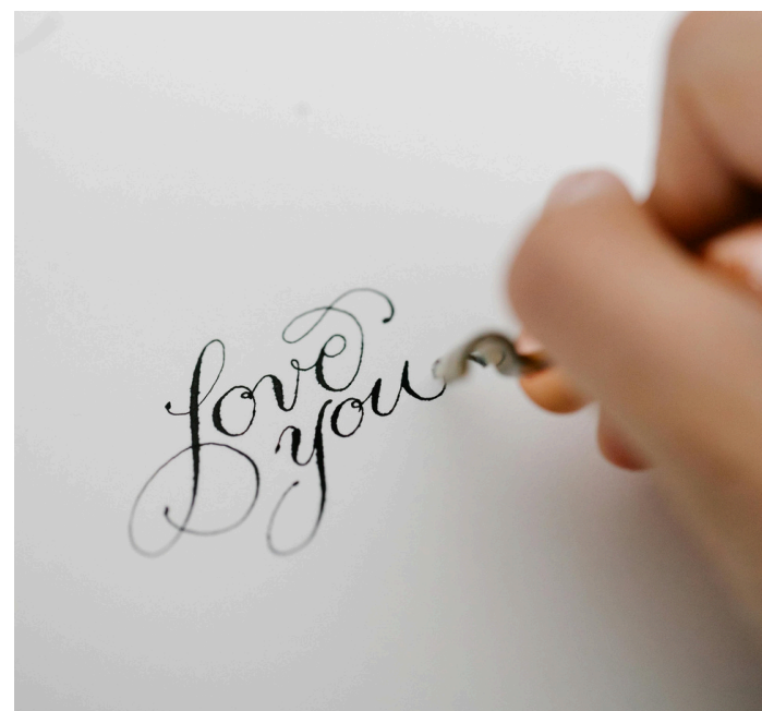
Custom message insert