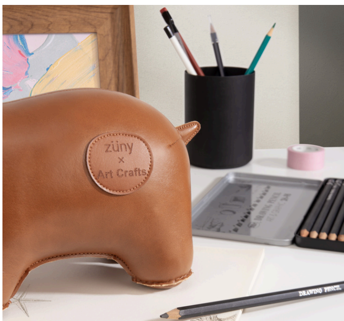
Subtle logo deboss